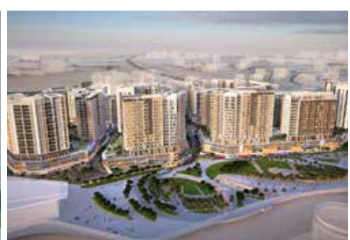
Expo 2020, Dubai, UAE