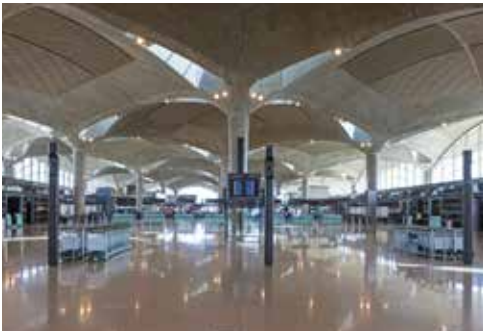
Queen Alia International Airport, Amman, Jordan