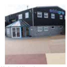
United Kingdom Terraco acquires Addagrip Surface Treatments UK Ltd