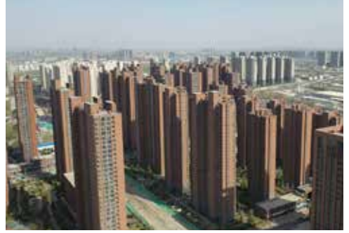
LVDU Mansions, Zhengzhou, China