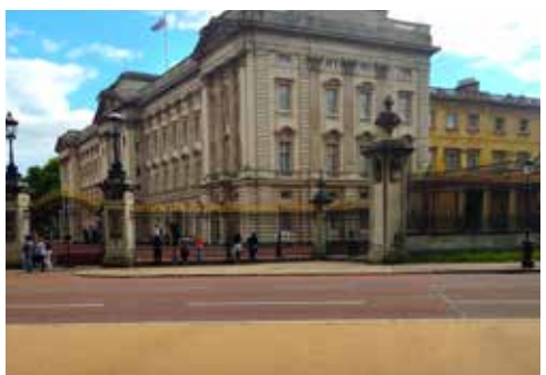
Constitution Hill, London, UK (Outside Buckingham Palace)